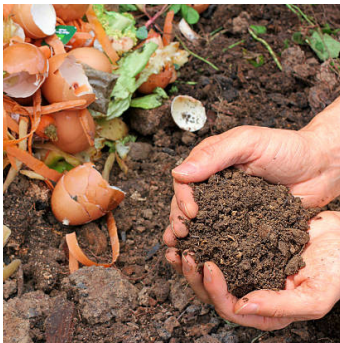
CGTC awarded grants to study organic waste and for sustainable transportation

the Territory for this opportunity. Tour attendees learned about how solar power is produced from the plant and supplied to the WAPA grid through a substation, the different solar plant components, as well as the design and installation considerations necessary for developing utility-scale solar energy in a hurricane prone region.